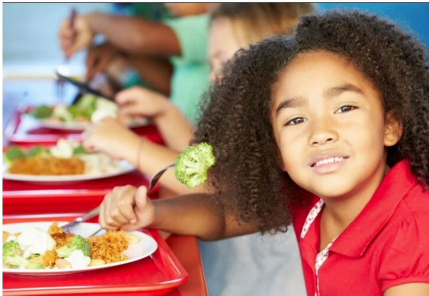
The new school lunch law will go into effect next year